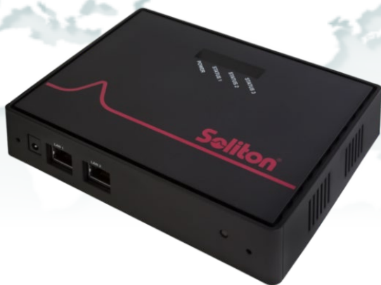
NetAttest LAP Cloud Sensor

Detect and block unauthorized devices connecting to your networks by simply installing this sensor on each LAN.